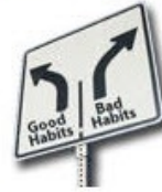
6) Negative Habits