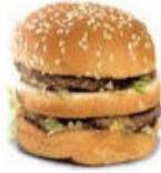
2) A Poor Diet