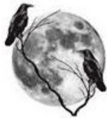
10) Negative Psychic Activity