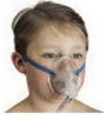
8) Poor Breathing