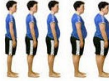
3) A Lack of Exercise